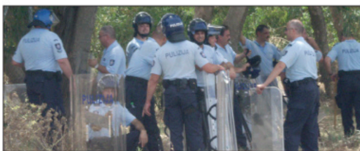
Police in riot gear resting outside the Safi compound after the situation was brought under control yesterday.

In what was described by soldiers manning the detention centre as "the worst breakout ever", over 300