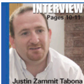
INTERVIEW Pages 10-11