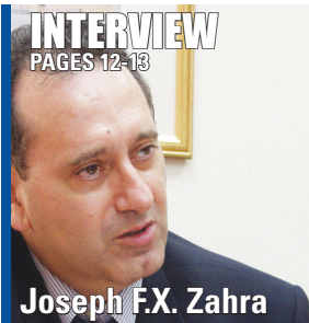
INTERVIEW PAGES 12-13