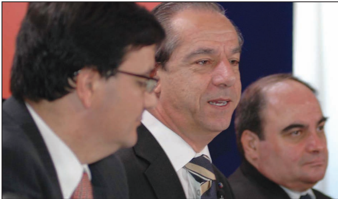
Not yet please: social partners reacted with caution with most stating that they are still studying the government's Pre-Budget document which was launched by Prime Minister Lawrence Gonzi and Parliamentary Secretary Tonio Fenech last Saturday

Budget document as one will know the general lines on which one can make and build one's proposals," the GWU Secretary-General told BusinessToday.